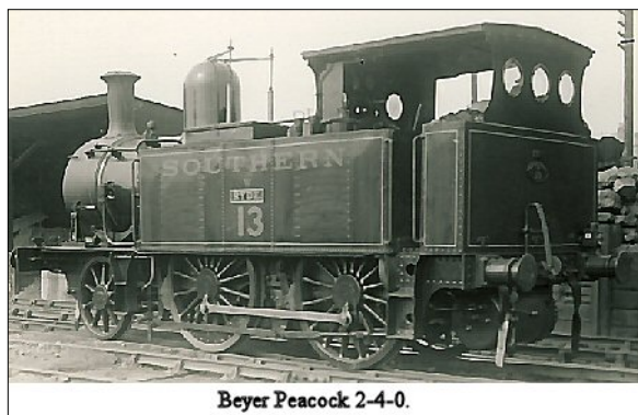
Beyer Peacock 2-4-0.

1864 - 1879 - 1932 - 1936 - 1946 - 1948 - 1950