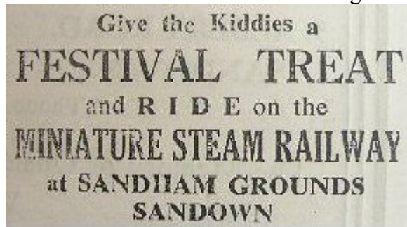
The 1951 advert with a play on the word "Festival" (of Britain)