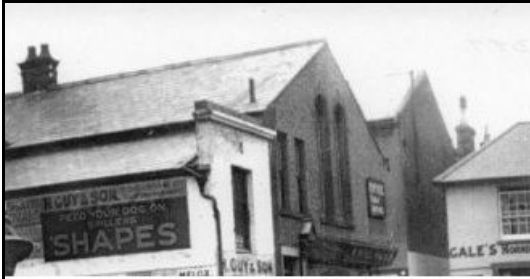
The first Sandown Conservative Club in Bridger Street 1878. Note the Commercial Hotel public house to the right of the picture.

Before the emergence of the Labour Party in 1900, which was then only a parliamentary pressure group, only two parties of any importance existed, namely the Conservative party and the Liberal party. Sandown had many Conservatives, notably in the upper area of town (Beachfield Road, The Broadway, Nunwell Street etc;) and in 1868 there was talk of them creating a club in which to socialize. The idea lay dormant for ten years until somebody recognised the Old Hall on the corner of Union Road and St. John's Road