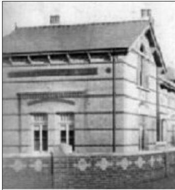
The second Conservative Club on the corner of Leed Street & Pellmont Road.

By June 1885 there were nearly 200 members the largest number of members since the club was started in 1878. Club dinners during this period were held at the Oddfellows Hall in Pell Street (this building would eventually metamorphose into the Rivoli Cinema as Pell Street would into Station Avenue).