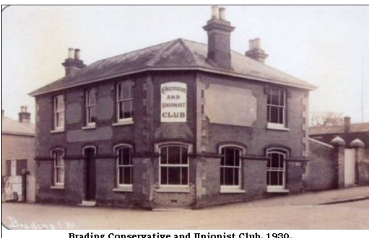
Brading Conservative and Unionist Club, 1930.

The completion of the car park allowed entry from York Road as well as Station Avenue. This required the compulsory purchase of two houses by the Council at a cost of £3,500. No. 10, Milton House and No. 12, Spencer Villa in York Road, these were demolished and the present car park completed. Parking charges were not introduced immediately but the car park quickly became a dumping ground for unlicensed cars and other indiscretions, which inevitably accelerated the process of charging for the pleasure of parking there.