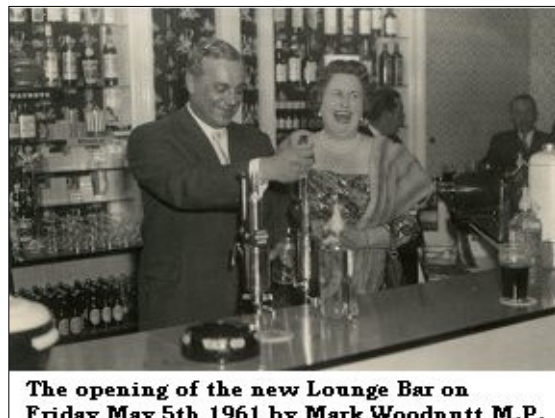
The opening of the new Lounge Bar on Friday May 5th 1961 by Mark Woodnutt M.P.