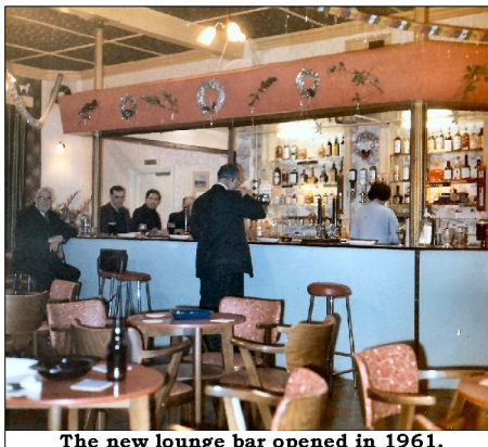
The new lounge bar opened in 1961.