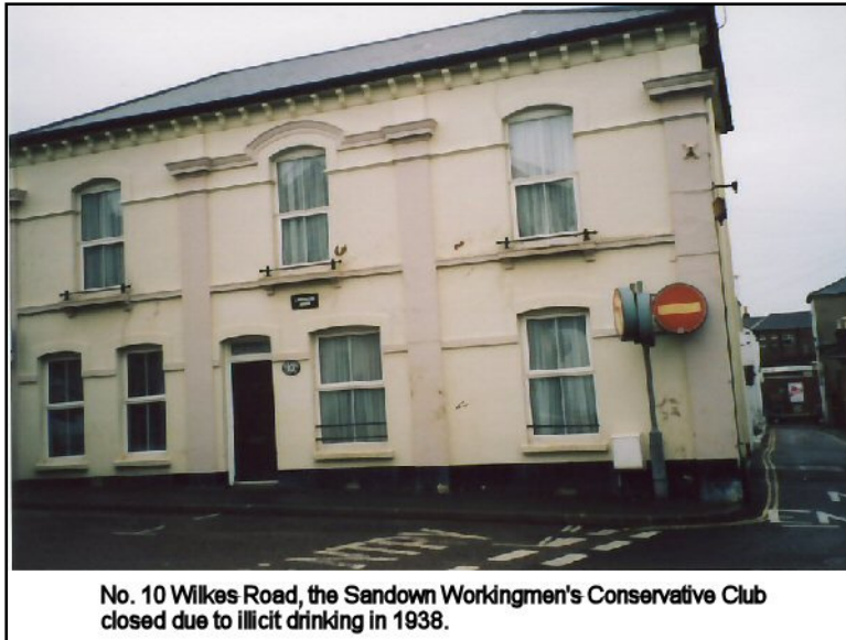
No. 10 Wilkes Road, the Sandown Workingmen's Conservative Club closed due to illicit drinking in 1938.

were able to form a new club on a satisfactory basis. The general idea was that the new Committee would comprise representation from the local branch of the Isle of Wight Conservative Association but agreement could not be reached and the Club closed. It re-opened in November 1923 and continued in much the same vein, usually managing to pay their financial commitments but never accruing any substantial amount of capital for which to purchase the club.