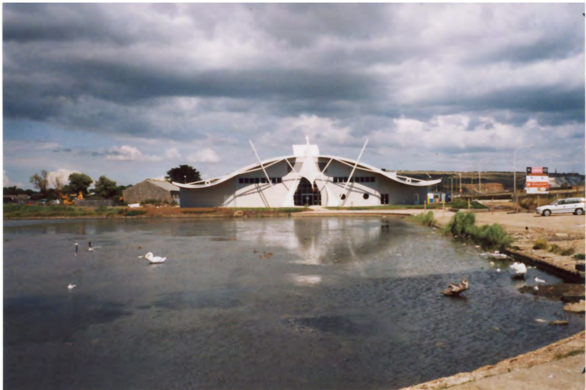
Youngsters have other interests these days, the Canoe Lake devoid of business in 2001 and the football pitch rendered extinct by a dinosaur museum.