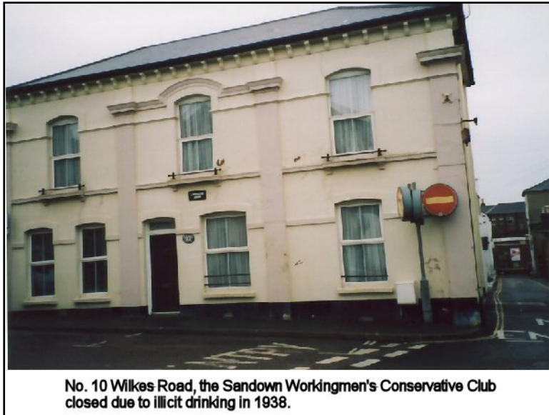
No. 10 Wilkes Road, the Sandown Workingmen's Conservative Club closed due to illicit drinking in 1938.

were able to form a new club on a satisfactory basis. The general idea was that the new Committee would comprise representation from the local branch of the Isle of Wight Conservative Association but agreement could not be reached and the Club closed. It re-opened in November 1923 and continued in much the same vein, usually managing to pay their financial commitments but never accruing any substantial amount of capital for which to purchase the club.