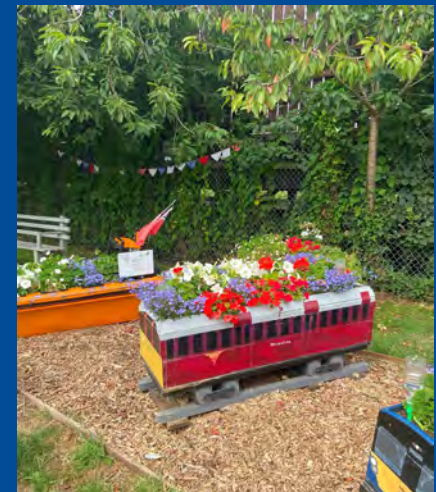
Selection of images from the Lake green spaces, as visited on the third day.